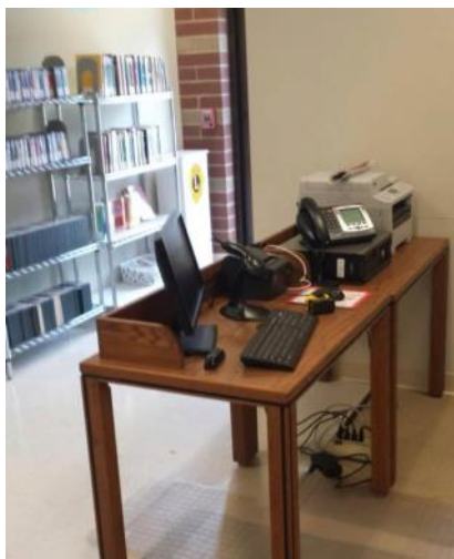
Temporary circulation desk