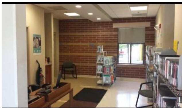
Library space with wooden partition removed