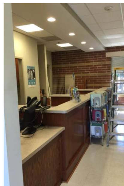
Wooden partition in place with plexiglas removed