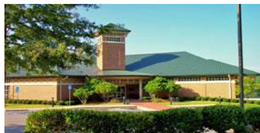
Dawson County Library 342 Allen Street Dawsonville, GA 30534