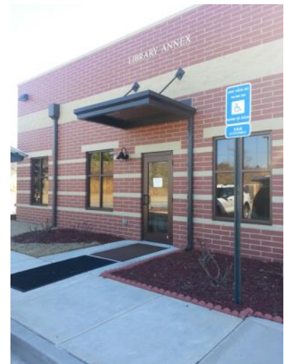
Chestatee Regional Satellite Library 145 Liberty Drive (Firestation 2) Dawsonville, GA 30534