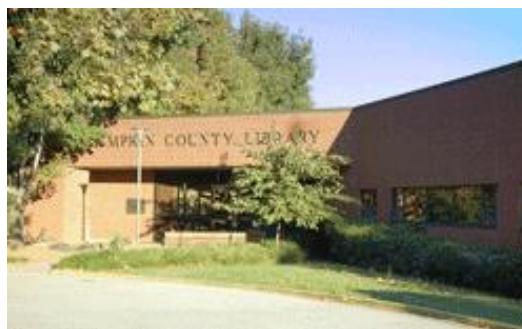
Lumpkin County Library 342 Courthouse Hill Dahlonega, GA 30533