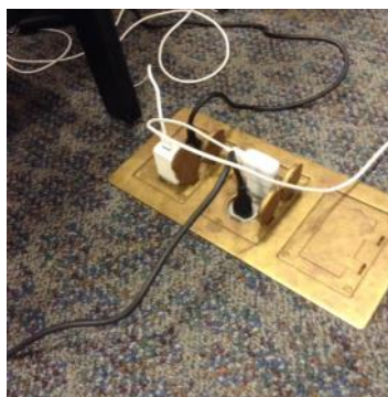
What one of MANY charging stations looked like in the library after the storm.

We're more than computers. More than internet. More than books. We're here to help.