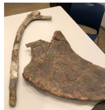
Triceratops frill and rib