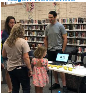
Piano playing using bananas