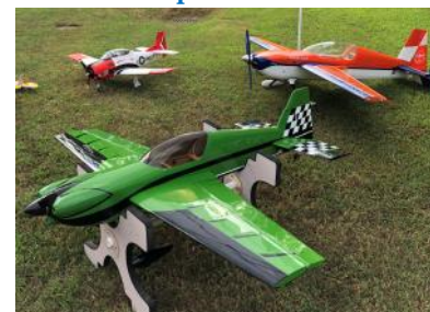
N GA Model Aviator planes